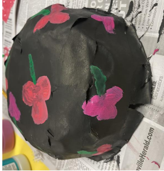
Step Eight: Decorate